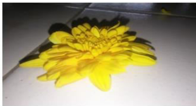
Figure No2-Blooming Flower

Chrysanthemum Indicum L. flower plant was collected from R. K. Pharmacy College Hebal Garden Kashipur surai, sathioan, Azamgarh Uttar Pradesh. Yellow-petalled flowers were hand-picked. Following full bloom. The collected plant flower were authenticated from the Department of botany from B.H.U. by Prof. N.K. Dubey the plant scientist.(Voucher specimen no. Astera.2025/01) After the authentication only we made them for ready for extraction process.