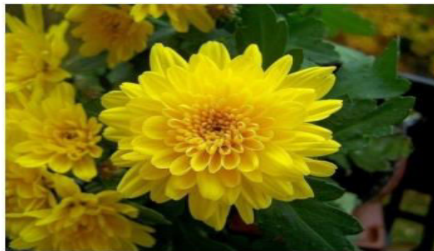
Figure No.1- Chrysanthemum Indicum . Flower Synonyms:

Chrysanthemum indicum , a member of the Asteraceae family, is a common plant. Its blooms are tiny and yellow. The health advantages of Chrysanthemum indicum are well known around the world. Traditional medicine uses C. indicum to treat a variety of ailments, such as stomatitis, colitis, and pneumonia. Additionally, it can help cure symptoms of high blood pressure, whooping cough, vertigo, fever, and sores. C. indicum has been used as a culinary ingredient to cover up tastes and in mixed spices. In Korea, it has also been utilized since ancient times to make teas and alcoholic beverages with flowers.[15]